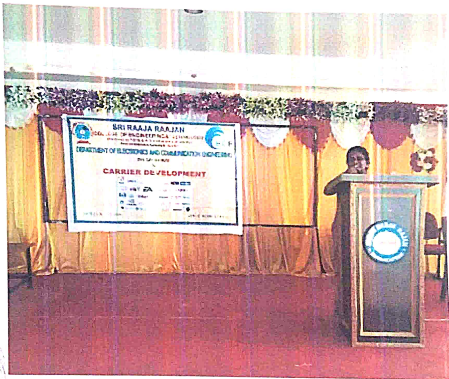
Fig: Seminar on Carrier Development at 15.11.2019